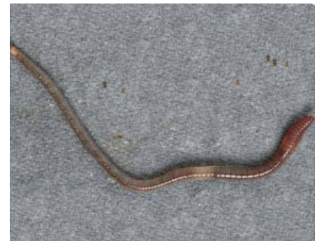
OCTAGANAL TAILED WORM