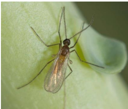
Figure 1. Adult swede midge

Identification: The adult swede midge is a tiny light brown fly roughly 1.5–2 mm (1/16 in.) (Figure 1). It is difficult to properly identify from other closely related midges. Larvae are small (0.3–3 mm), transparent, off-white-to-yellow maggots that are hidden within the growing point of the plant (Figure 2).