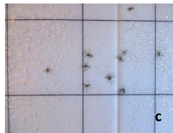
Figure 5. (a) Each swede midge trap is placed on a stake and hangs no higher than 25 cm from the ground. (b) The lure is positioned on the inside ceiling of the trap and is replaced every 4 weeks. (c) A sticky lining is positioned in the floor of the trap and are checked and replaced at least twice a week, counting the number of midge found per trap per day.

Swede midge traps can be purchased at Solida: www.solida.ca . For each field, monitored for an 8 week period, the following supplies are required: