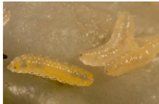
Figure 2. Swede midge larvae

Life Cycle: There are four to five overlapping generations per year in Ontario starting in mid-May until October (Figure 3). Each generation can take 24 to 31 days to complete, depending on temperature. Swede midge overwinters as a larva in a cocoon in the soil, pupating in the spring before emerging as an adult. First adult emergence is in mid- to late May, though not all swede midge emerge at the same time. There are two main emergence phenotypes that have their first peaks about 10-14 days apart in late May to early June. Rainfall totaling 6mm or more over a 7 day period triggers emergence. Adults live for only 1 to 3 days and, although considered to be relatively weak fliers, they are capable of moving several hundred meters and can be carried much further by wind. Females are ready to mate on the same day they emerge, laying their eggs in clusters of 20-50 eggs on the youngest, most actively growing portions of the host plant. Larvae hatch from the eggs and feed in clusters on the growing point of the plant. Larvae may feed for 1 to 3 weeks, depending on temperature. Once mature, the larvae drop to the top few centimeters of soil to pupate for two weeks until emerging as an adult. Some larvae of every summer generation will enter diapause with increasing numbers as day length shortens in late summer. Some midges (2-10%) remain in diapause for two years, possibly more.