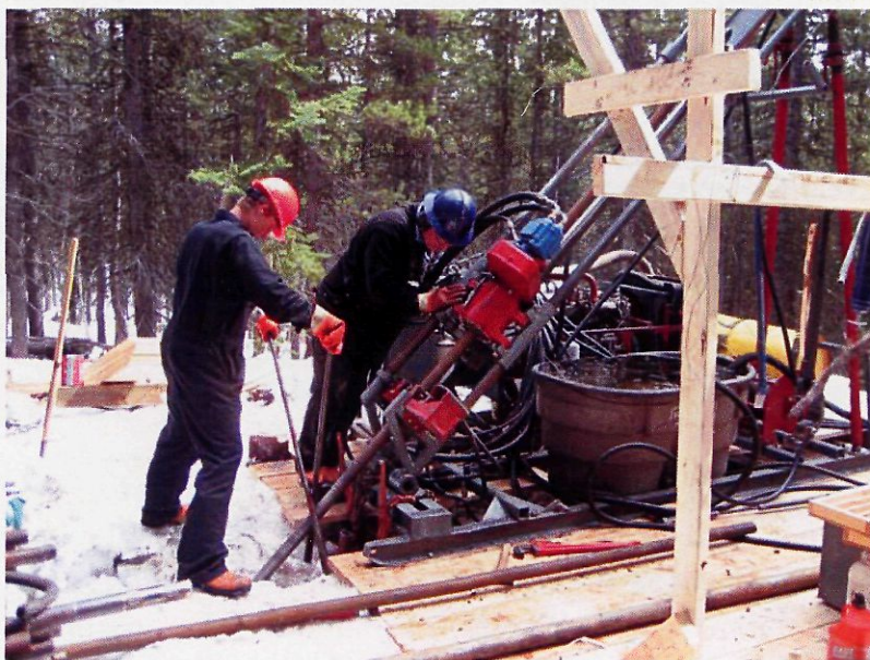
Drilling – May 2006

in-diameter magnetic low zone interpreted to be a possible large dome structure. The NW Zone could represent a significant northern extension of the RM Mineral