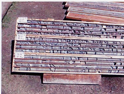
Drill Core – RM2006-21

50.9-52.4m (1.5m). The recent drilling work has substantiated the strong potential for a