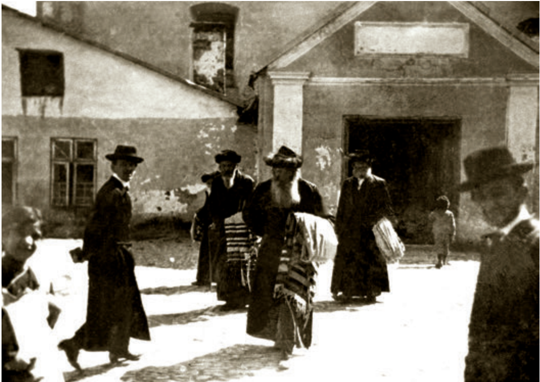
Jews going out of the synagogue in Dukla, 1916–1917.

Traces of Jewish presence ¶ In 1758, the old wooden synagogue burnt down in a fire. An impressive new one of brick and stone was built in its place. The rectangular main hall measured 12 by 16 metres; on the western and northern sides it was adjoined by extensions housing a porch, a library, and a prayer room for women. The synagogue was devastated by the Germans during World War II. What survives today are the walls of the prayer room with a stone portal and the alcove for the aron ha-kodesh. In some places, it is still possible to discern traces of inscriptions with texts of Hebrew prayers. ¶ Near the synagogue, the bet midrash building has also survived (8 Cergowska St.); it was built in 1884, after another fire in the town, on Rabbi Tzvi Leitner's initiative. That fire, one of many that devastated