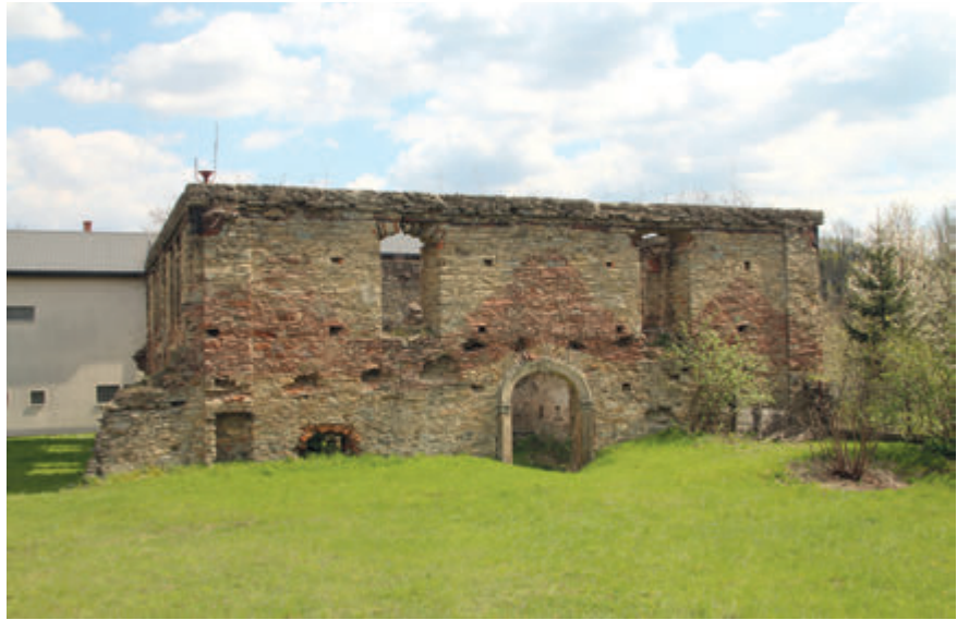
Ruins of the synagogue in Dukla, 2015.