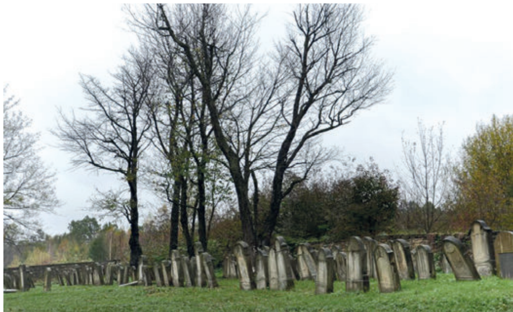
The new Jewish cemetery in Dukla, 2014.

century, with a few dozen matzevot surviving. The owner of both cemeteries