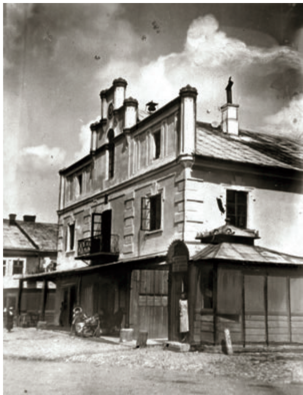
Town hall in Dukla, 1918–1936