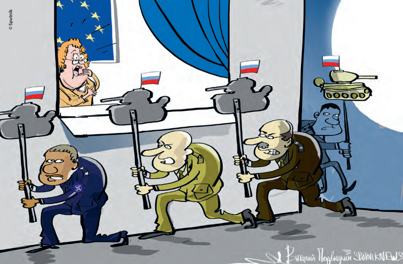
Russian news – Russian media portrays Russian invasion of Ukraine as fake news made up by NATO generals.