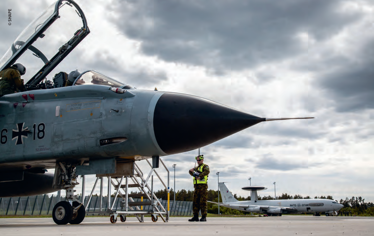
German Tornado parked with NATO AWACS, Ämari Air Base, Estonia 2015.