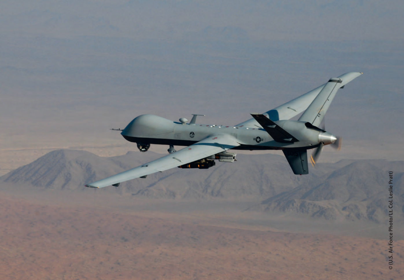
A USAF MQ-9 Reaper, armed with GBU-12 Paveway II laser guided munitions and AGM-114 Hellfire missiles, flies a combat mission over southern Afghanistan in 2008.