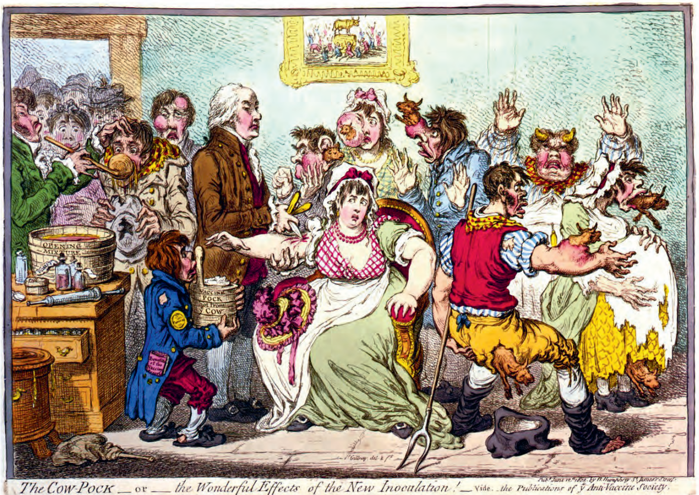
Anti-vaccine campaign cartoon, United Kingdom, 1802.