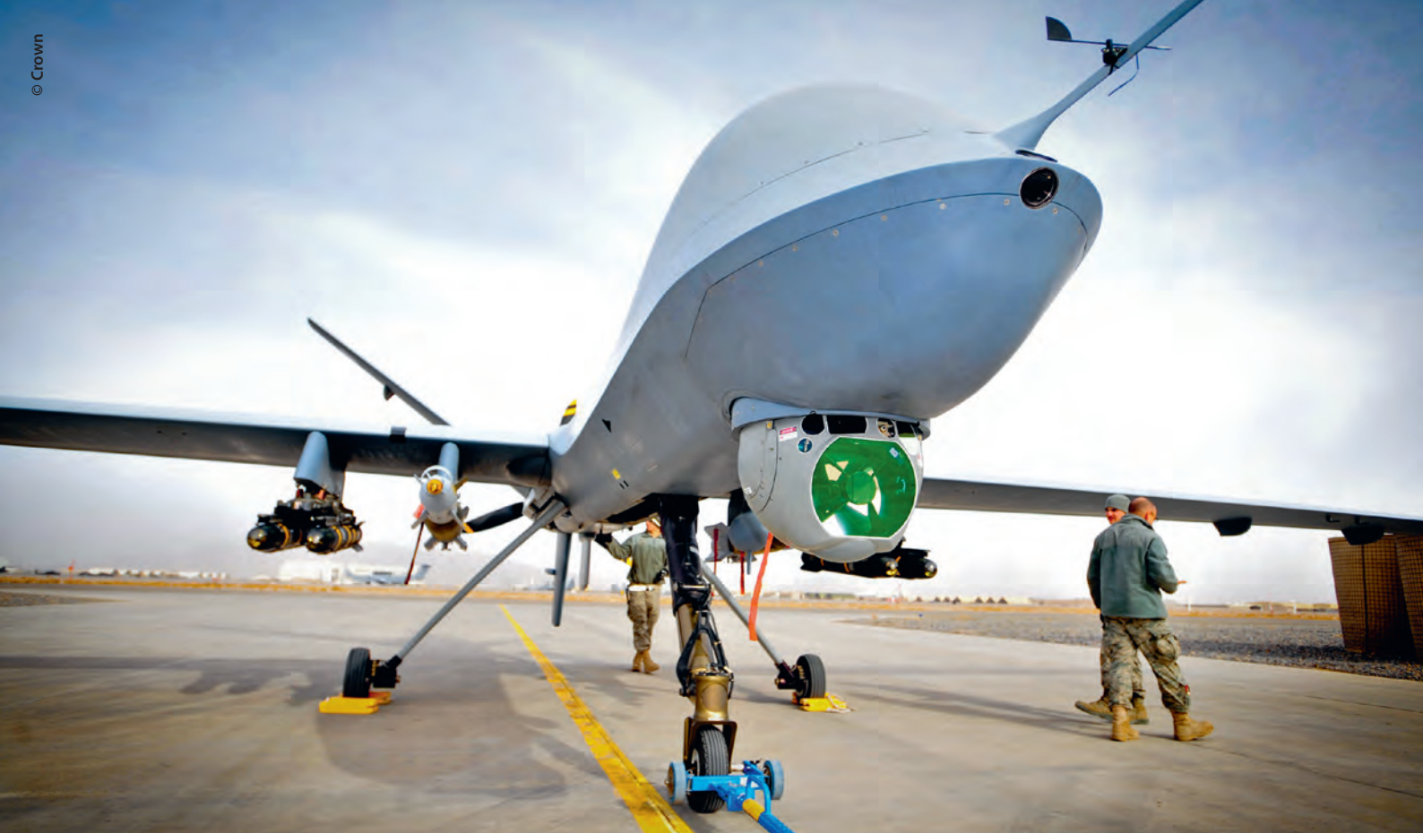
A Reaper of 39 Squadron Royal Air Force, Kandahar Air Field, Afghanistan. The RAF used the Reaper in Afghanistan mainly as an ISR asset.