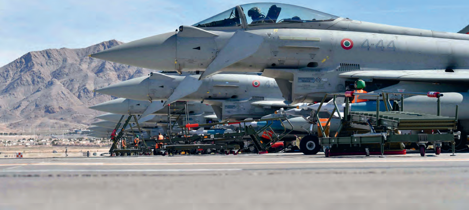
The Italian Typhoons lined up at Exercise Red Flag.