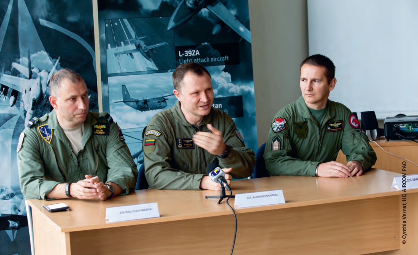
Three NATO airmen briefing the media on the NATO Air Policing Mission at Šiauliai Air Base, Lithuania, 2015. Educating the media in Air Power is an important mission for NATO.