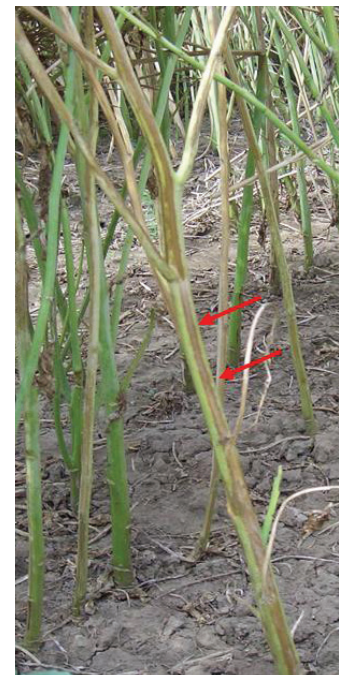
Figure 2: Field symptoms of Verticillium longisporum infection on Brassica napus showing one-sided stem discoloration