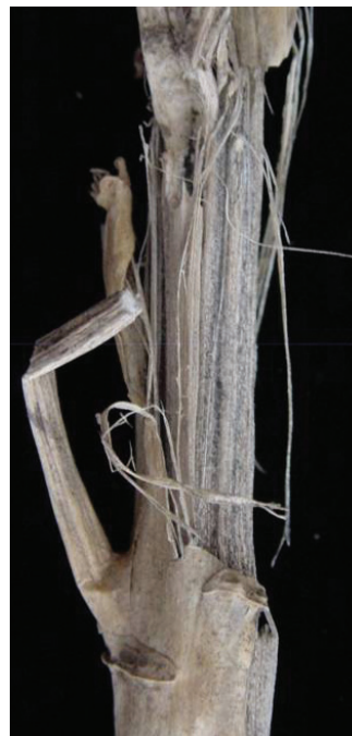
Figure 1: Layers of blackish microsclerotia underneath disrupted epidermis on the stem of a mature rapeseed plant