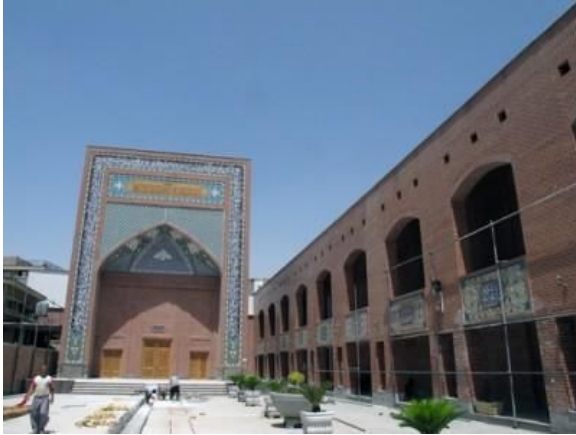
Sarcheshmeh Complex in Tehran

All of the expenses of Iran's International Cartoon Biennale, which will include the Holocaust cartoon exhibition in 2016, are paid by the Ministry of Culture and Islamic Guidance. No competition or exhibition is possible without receiving permission from this Ministry. The organizers of the Holocaust competitions and exhibitions are so close to Khamenei's office that this Ministry cannot refuse to grant permission to them.