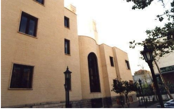
Saba Art and Culture Institute in Tehran

The Saba Art and Culture Institute, which hosted the first exhibition, works under the Iranian Art Academy, which is a governmental institution; its budget is approved by the Majles (Islamic assembly or parliament) and its board members are appointed by the government .