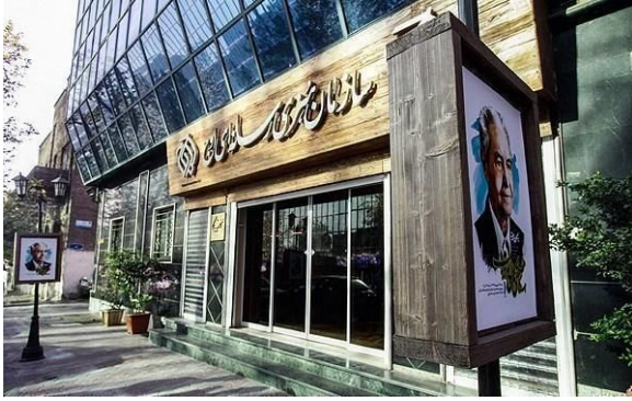
Owj Media and Art Institute headquarters in Tehran