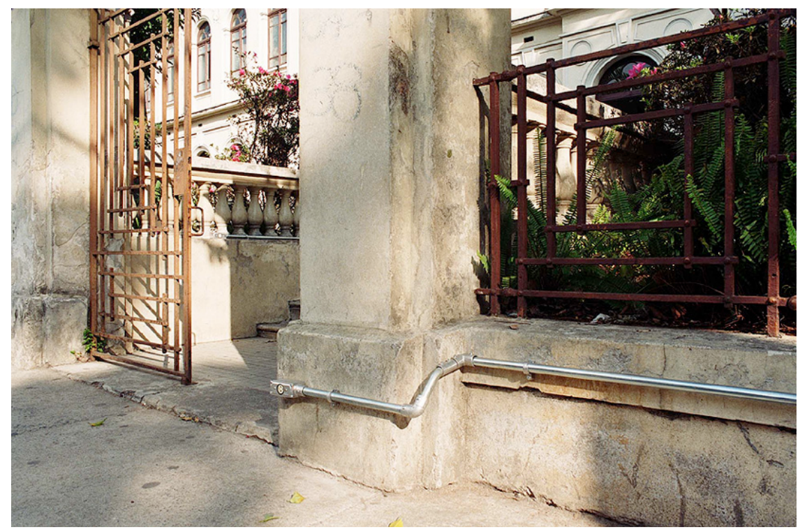
Rubens Mano, Pavement, (detail) 1999.