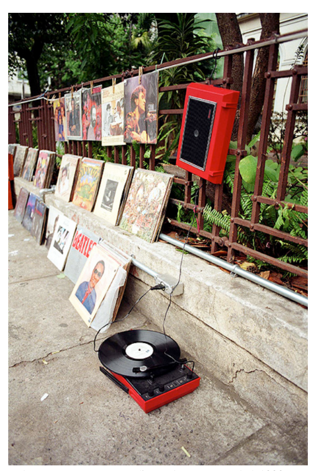
Rubens Mano, Pavement, (in use by street vendor) 1999.

Especially evident in Pavement and Sewer is Mano's interest in the tense and conflicted nature of the connections between public power and public good. Marked by an interest in impermanent situations and fragmented experiences, Mano's work has been focusing since 1984 on light as a primary subject and tool, extending this attention towards the related areas of photography and architecture. The issue of site specificity is discussed in updated form, conceived as an intervention