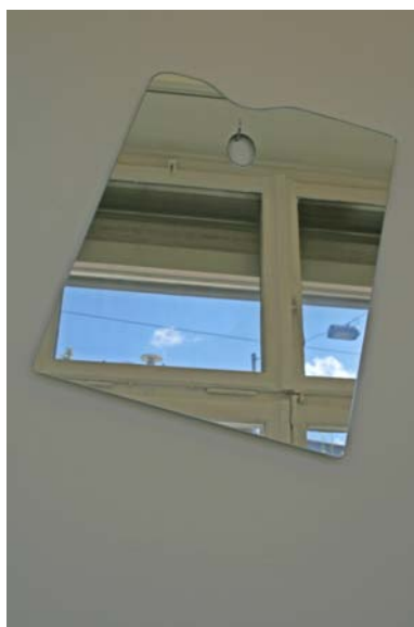
Window VI , 2009, mirror, 38.5 x 30 cm Window III , 2008, mirror, 40 x 29.5 cm