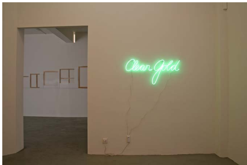
Unireverse , 2009, 2 neon writings, dimensions variable