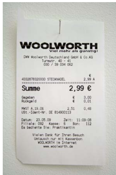
o.T. , 2009, receipt, pin, 5 x 10 x 2 cm