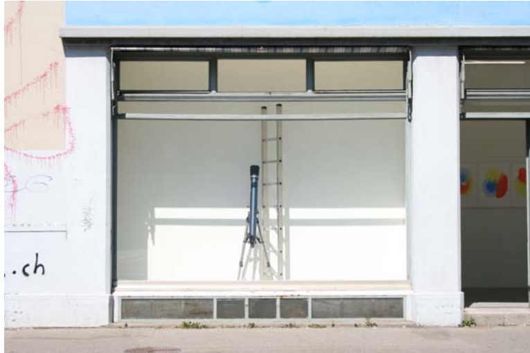
Sculpture (47° 23' 15.93" N 8° 31' 72" E), 2009, telescope, ladder, dimensions variable