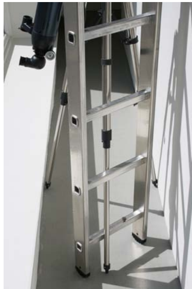
Sculpture (47° 23' 15.93" N 8° 31' 72" E), detail, 2009, telescope, ladder, dimensions variable