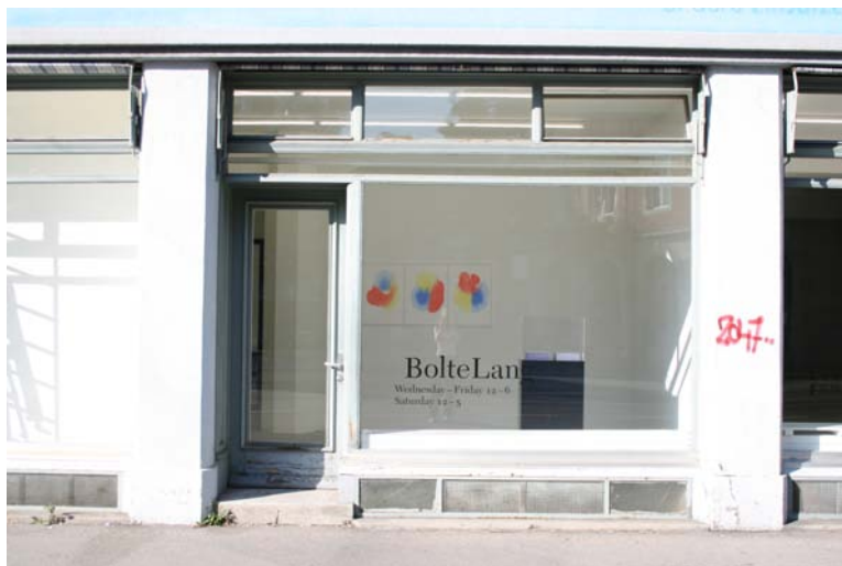
Installation view Minus zero , BolteLang, Zurich, Switzerland, 29 May – 11 July 2009