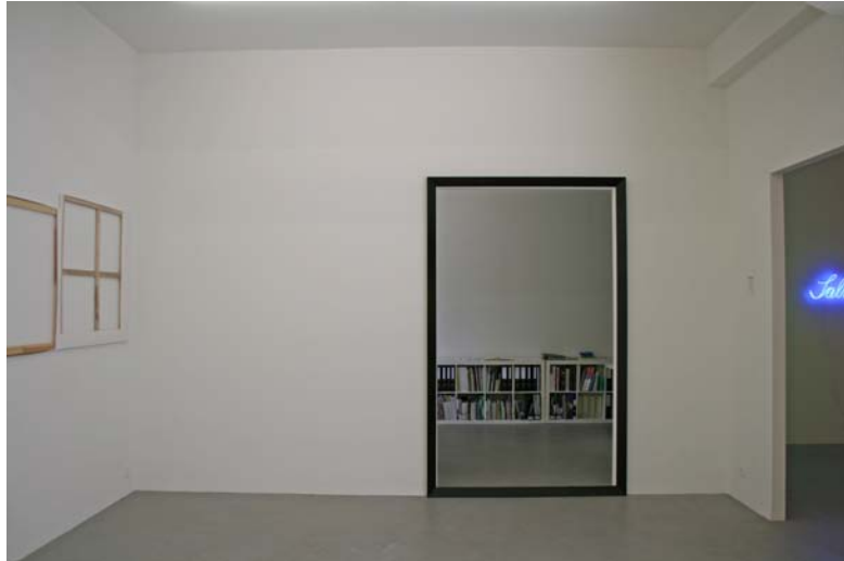
Gate , 2008/2009, Spruce, varnish, 254 x 154 x 5 cm