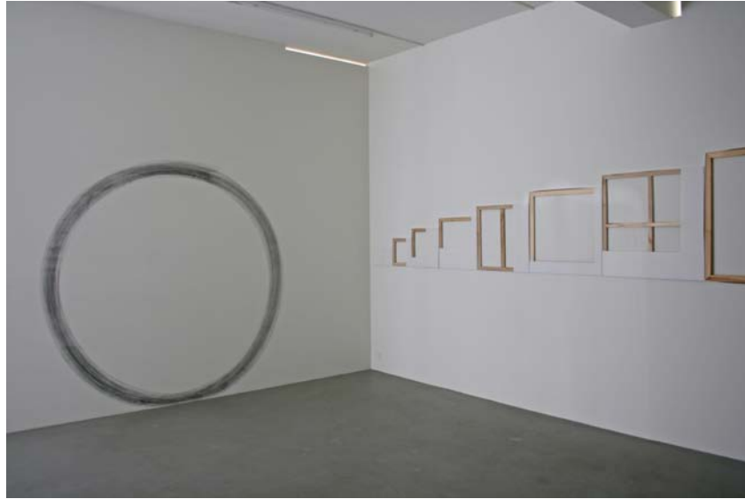
Sphere , 2009, graphite on wall, ed. of 2, dimensions variable Antinomie , 2009, 10 cut up canvases, from 10 x 10 cm to 100 x 100 cm growing by 10 cm