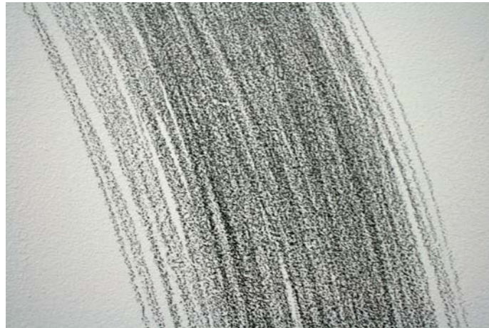
Sphere , detail, 2009, graphite on wall, ed. of 2, dimensions variable