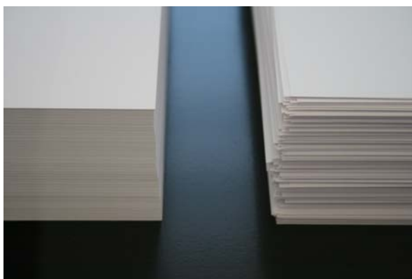
Manuskript , detail, 2009, 1000 sheets of paper, plinth, 120 x 57 x 40 cm