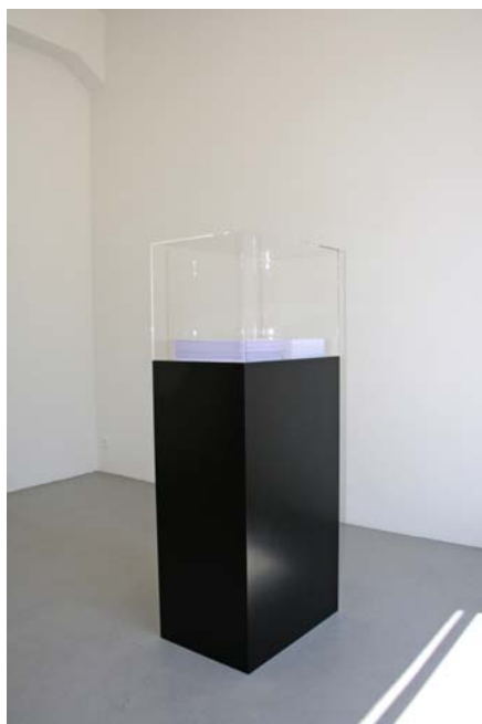
Manuskript , 2009, 1000 sheets of paper, plinth, 120 x 57 x 40 cm