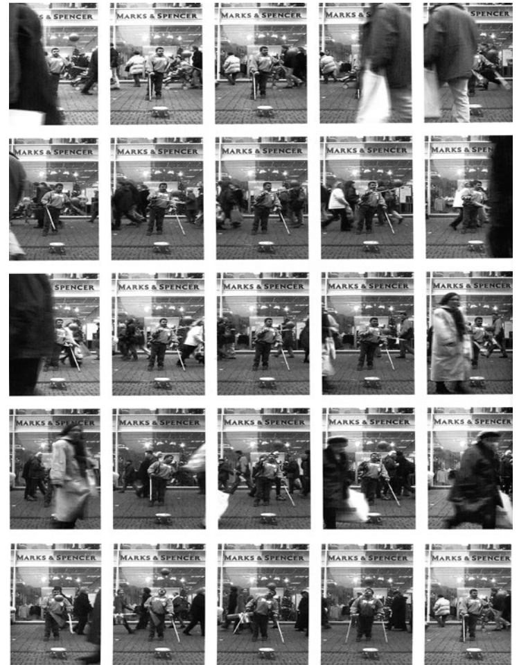
Sequence of Public Monument: Carlos , 1998

Innocent Colors started with a compilation of news stories downloaded from the Internet, in which the headlines and illustrations were linked. From here, Kaufmann relates two observations: the first is whether a photograph serves to illustrate news content and even whether an image can add information to what is apparently being communicated; the second is about Photoshop software, which