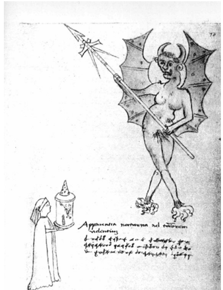
Monk with the projected figure of a she-devil

A special form of projection is the televisual one. What we see on the fluorescent screen, for example, of the Braun tube of a monitor, are points of light inscribed at amazing speed. The speed at which they succeed one another is so fast that they get round the