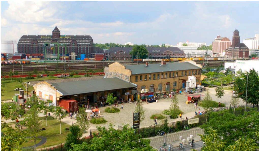
ZK/U – Center for Art and Urbanistics