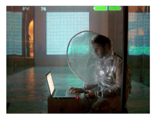
Ahmed Basiony, Thirty Days of Running in Place, Installation Documentation, 2010.

The original version of Thirty Days of Running in Place was presented at the 'Why Not?' exhibition in Cairo in 2010. [1] For thirty days, in a room enclosed in transparent plastic outside the Cairo Opera House and Palace of Arts, Basiony jogged for an hour wearing a plastic suit fitted with digital sensors that gathered and wirelessly transmitted data on his movements and other physiological parameters. The information gathered was then processed and projected onto a large screen as an ever-changing visual and aesthetic reflection of the artist's physical state. Described by curator Omar Koleif as 'evidence of the artist's belief in art functioning as a primal mechanisation of the self", Thirty Days Running in the Place is an 'abstract portrait of a body not just in motion, but changing physiologically under the influence of exercise' (Kolief, 2011).