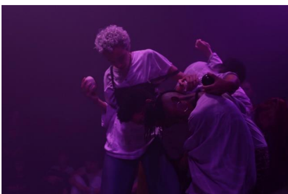
9. Last Yearz Interesting Negro and Phoebe Collings-James Sound as Weapon, Sounds 4 Survival , 2018 Wysing Polyphonic, Cambridge