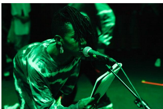
8. Last Yearz Interesting Negro and Phoebe Collings-James Sound as Weapon, Sounds 4 Survival , 2019 Borealis, Bergen