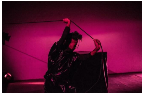
4. Last Yearz Interesting Negro and Rowdy SS 48 Hours, 2019 The Yard, London