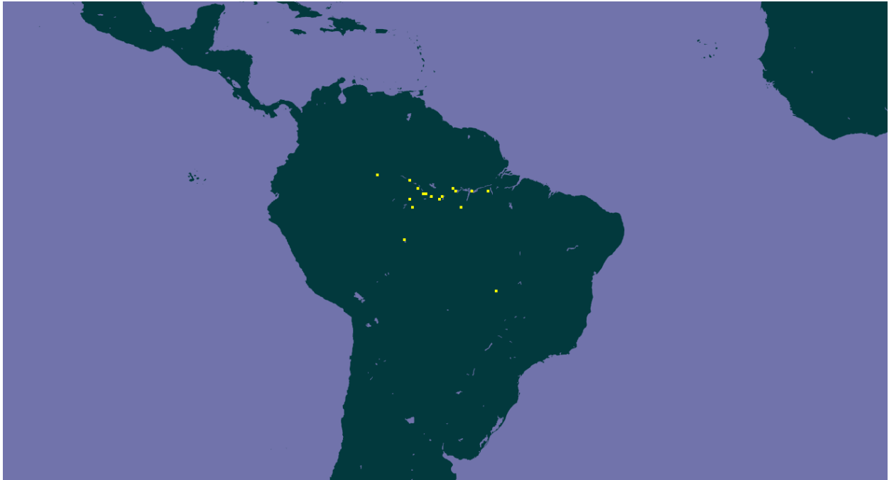
Figure 1. Known global distribution of Ancistrus dolichopterus . Locations are in Brazil. Map from GBIF Secretariat (2017).