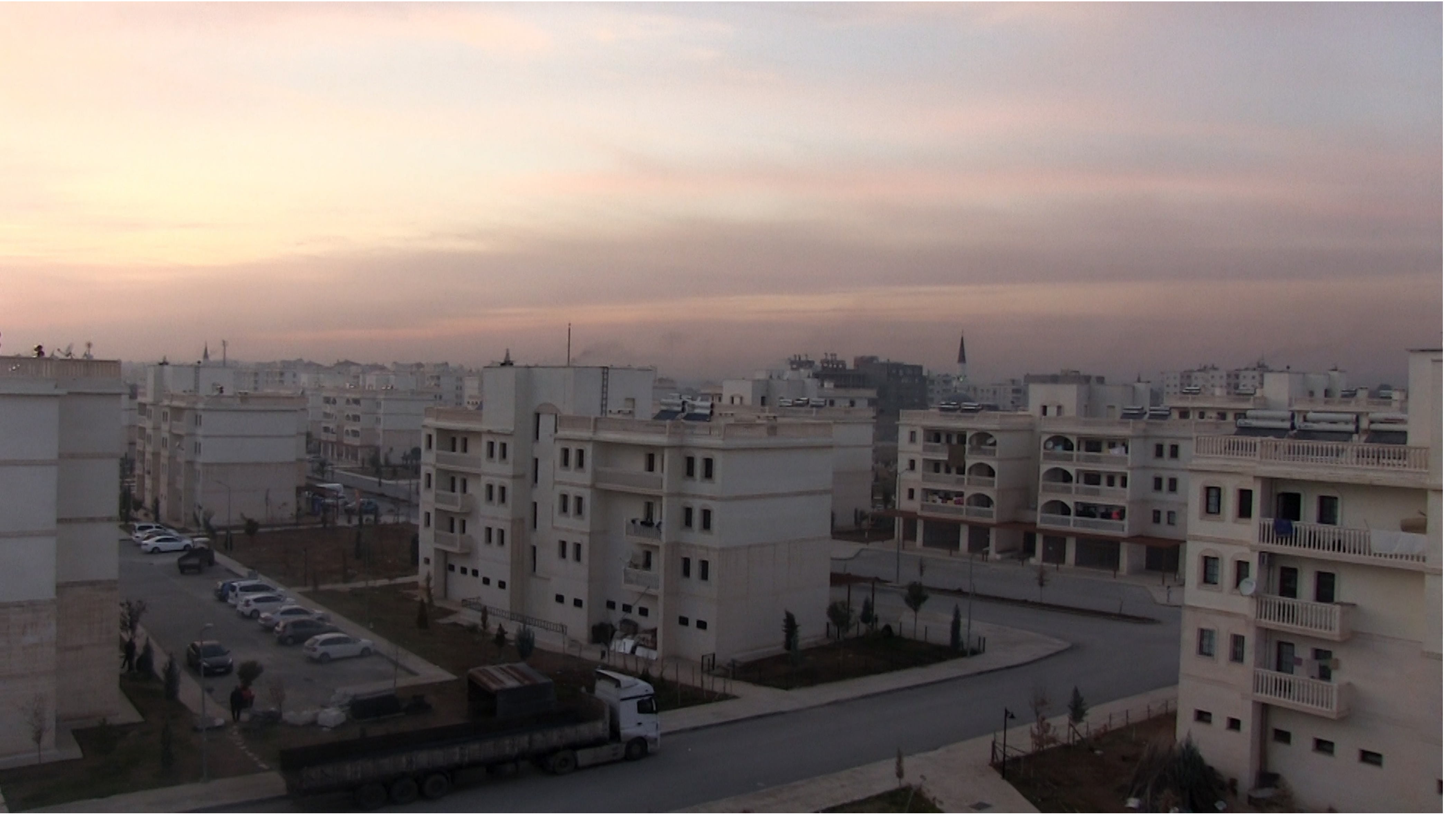
December 4, 2020, Nusaybin