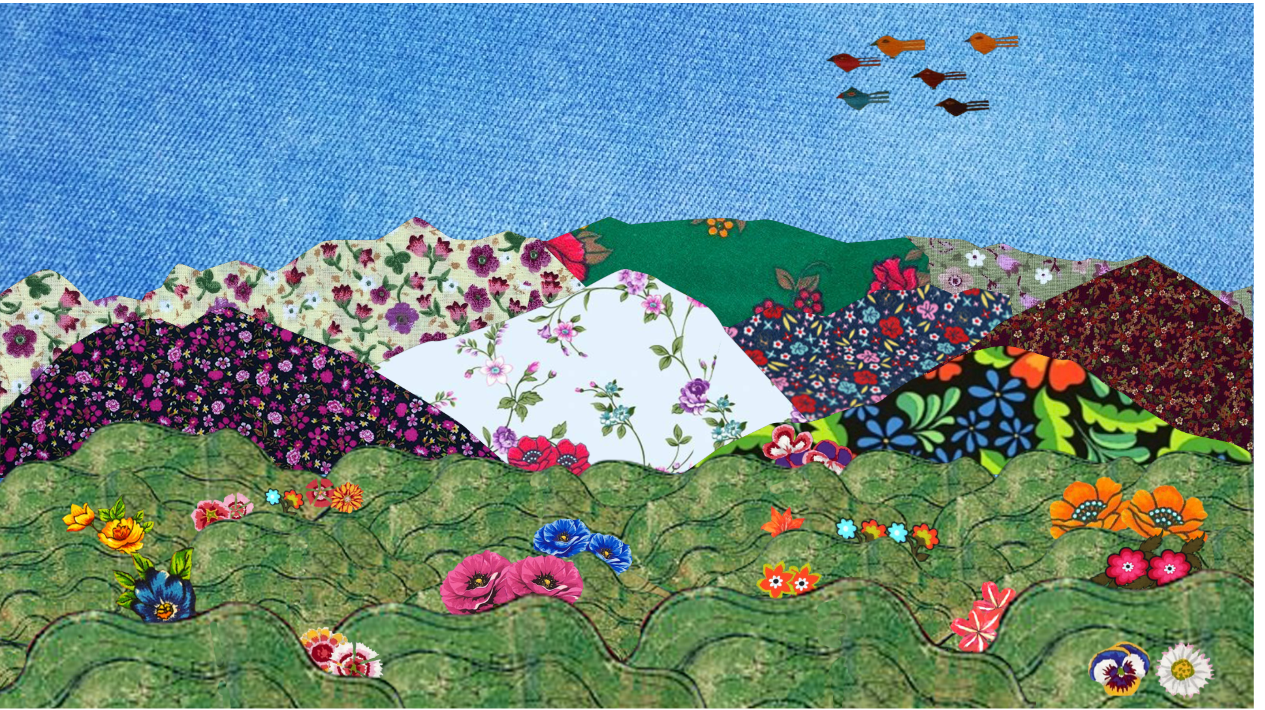
Cudi of the Wishes