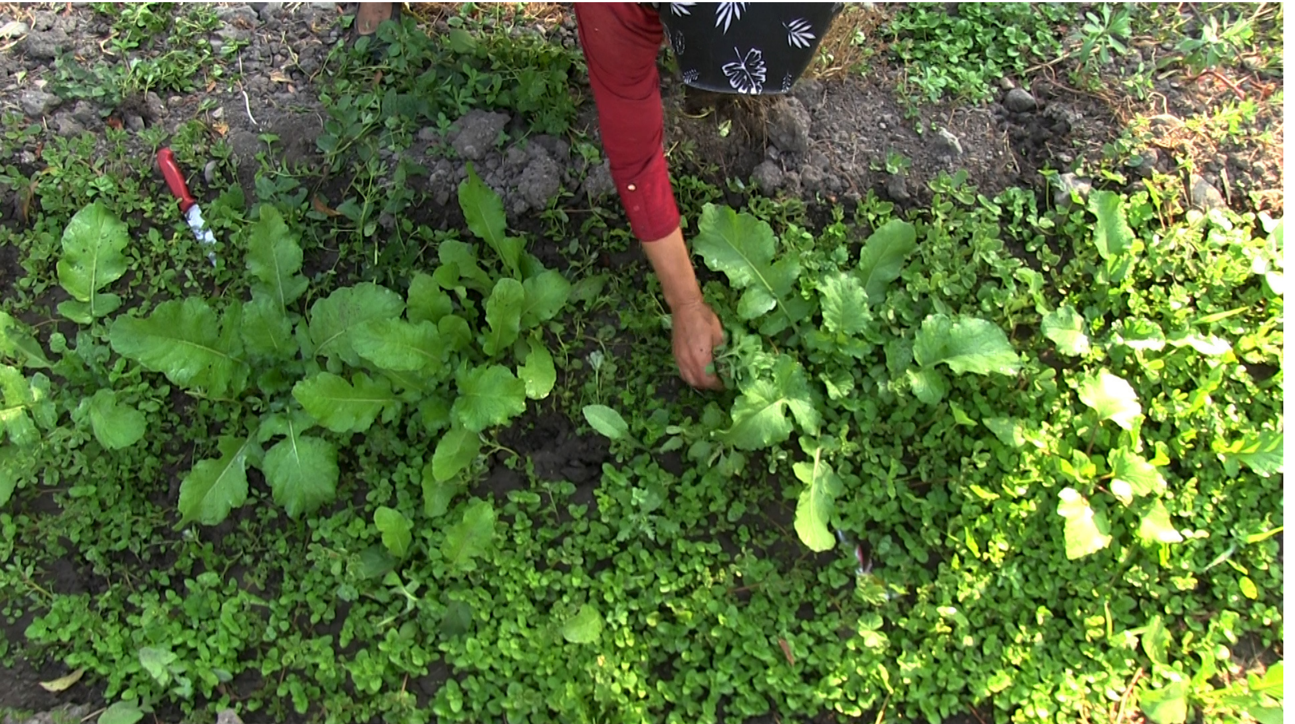
Gleaners, Dreams and Greens