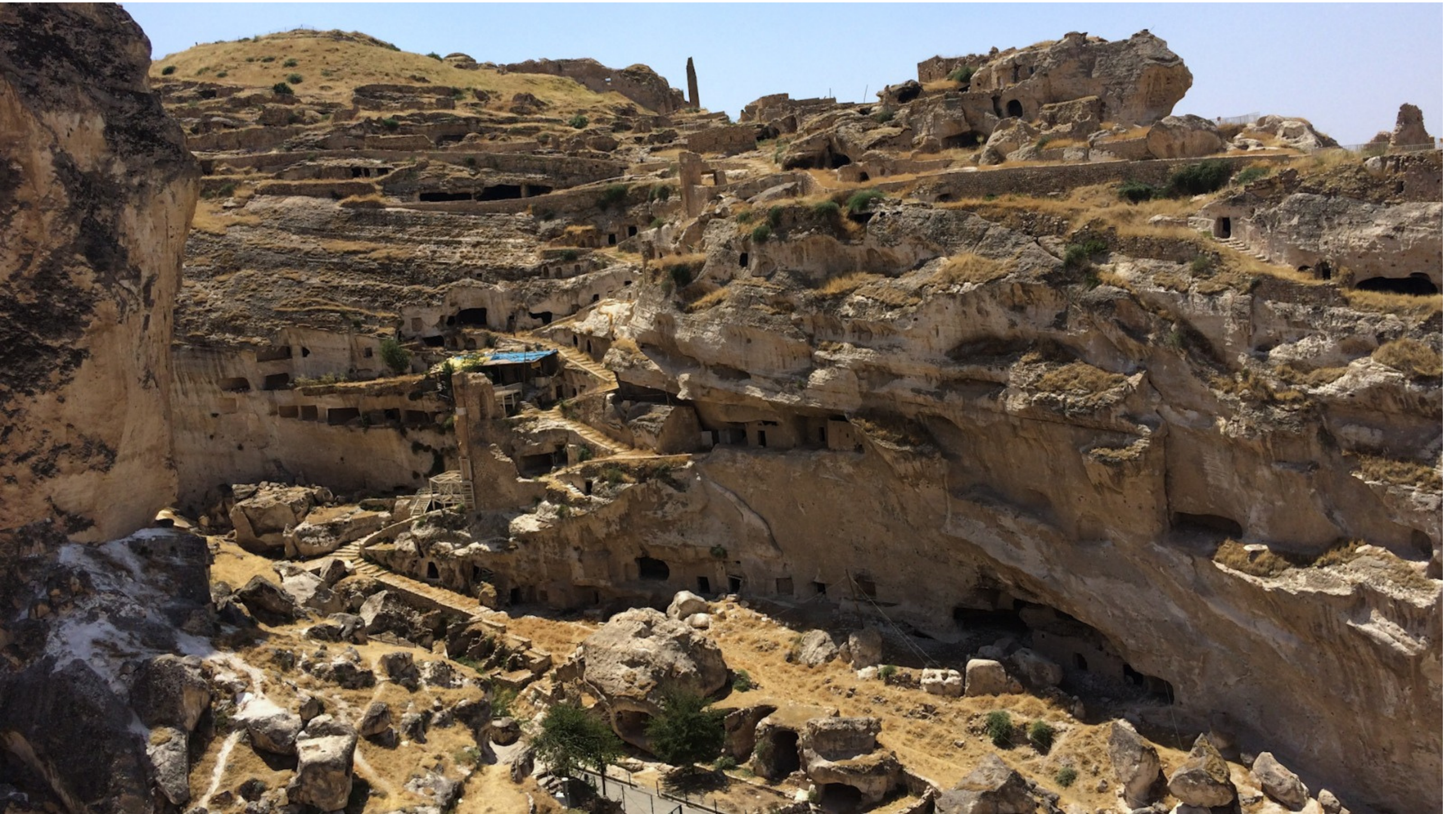
Stone and Water