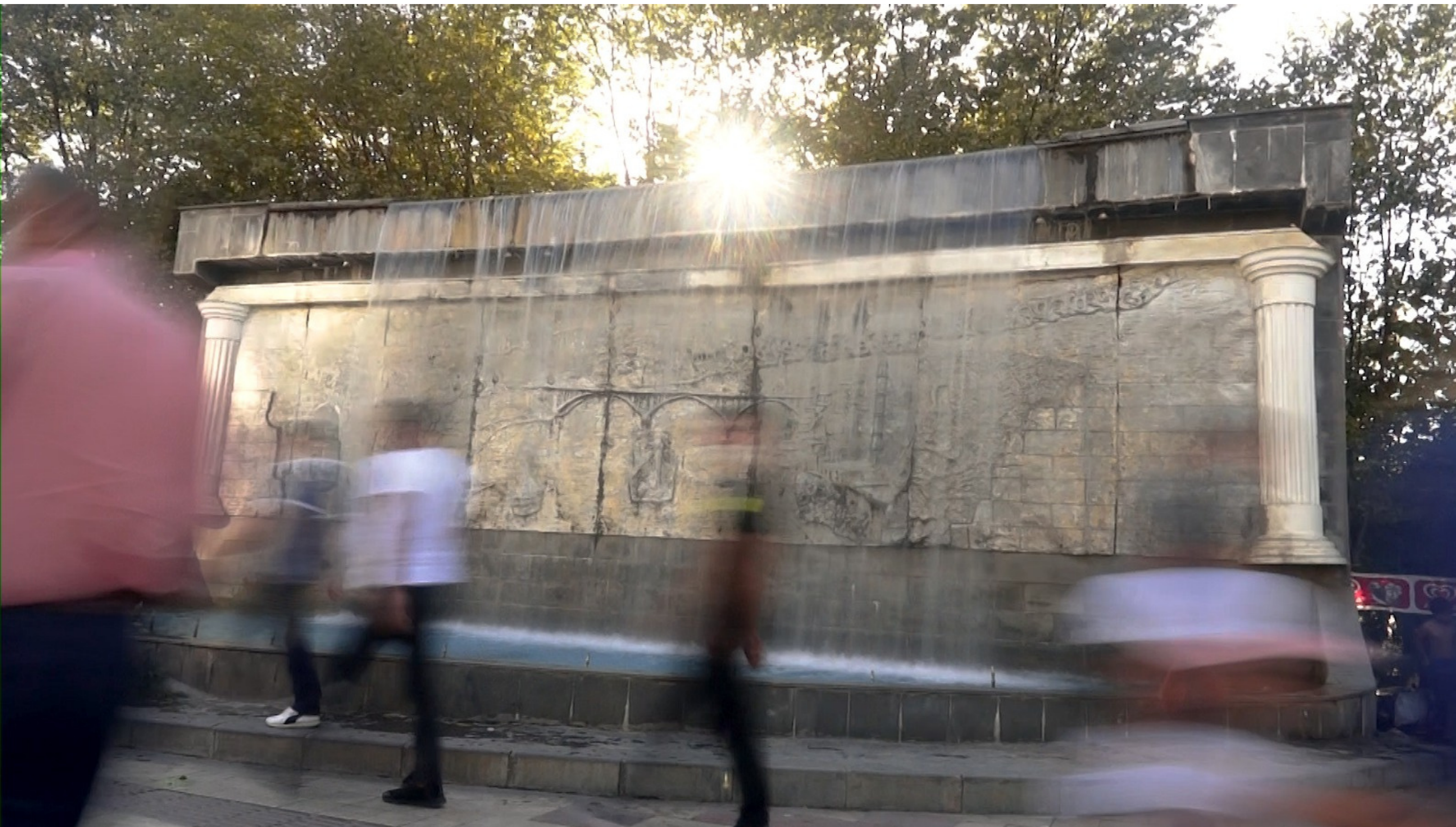
Director Nalin Acar Video, 5'14", February 2021 Batman

Hasankeyf has gone underwater following the construction of Ilisu Dam, and now decorates the walls of an ornamental pond in Batman. This pond, just like the historical Hasankeyf, has created its own ecosystem. By matching images with certain concepts and revisiting the same concepts in the context of different images, Stone and Water (Taş ve Su) invites the audience to constantly reexamine the meaning of these concepts and images with relation to each other. This playful structure also aims at pointing at the weight of witnessing.